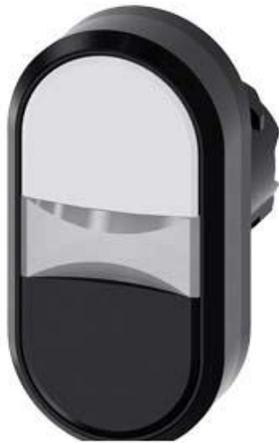
TWIN PUSHBUTTON, 22MM, ROUND, PLASTIC, WHITE, BLACK, FLAT BUTTONS